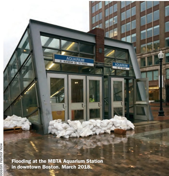
Boston Harbor Now

Spread the Cost Burden. Spreading the burden over multiple levels and a range of funding mechanisms will make climate