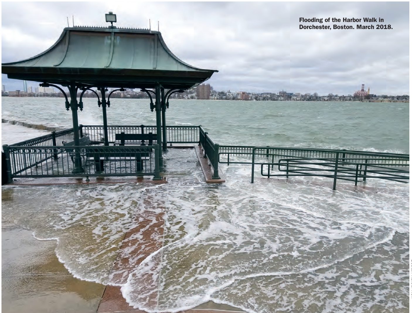
Flooding of the Harbor Walk in Dorchester, Boston. March 2018.

There is a growing realization that the future growth and prosperity of the region demand that sound investments be made to enhance climate resilience and reduce the risk of major disruptions to the economy and dislocation of vulnerable communities. Moving forward will require political will, courageous leadership, and closer collaboration with local communities and businesses. Together we can develop the regulatory and market frameworks needed to address this challenge and ensure the future sustainability and wellbeing of the region.