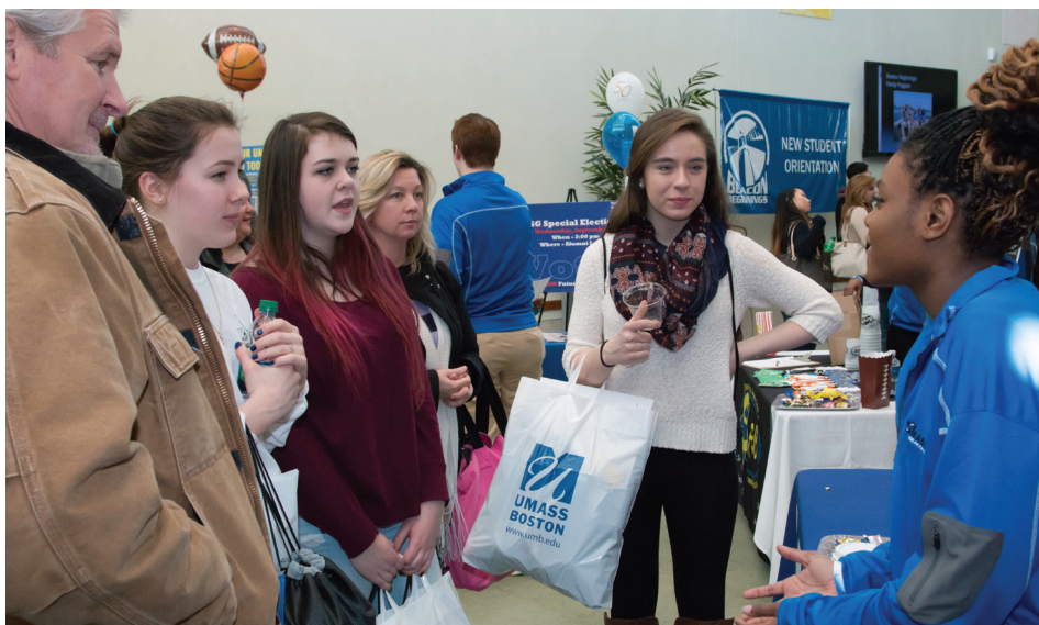
Accepted students and their parents ask a Beacons Ambassador questions during Welcome Day.