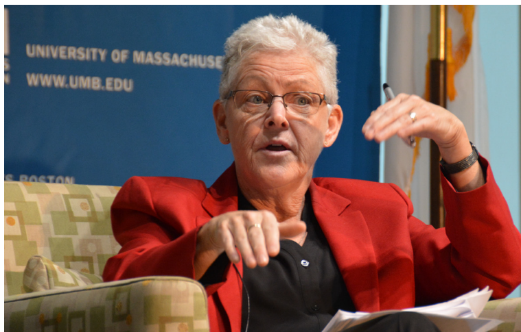
Gina McCarthy '76, who served as EPA administrator in the Obama administration, visited campus for a panel discussion on climate change.