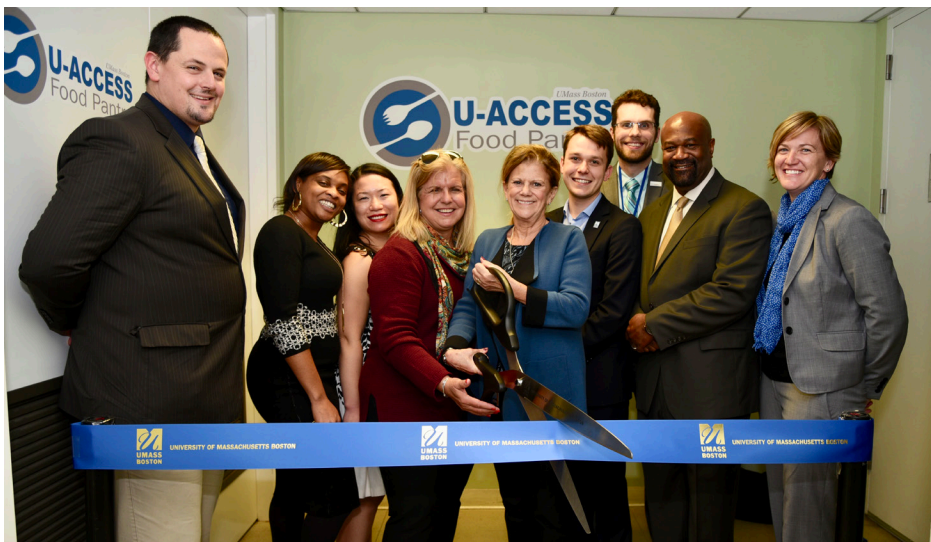
Student Affairs staff cut the ribbon on a newly expanded U-ACCESS food pantry on November 2.