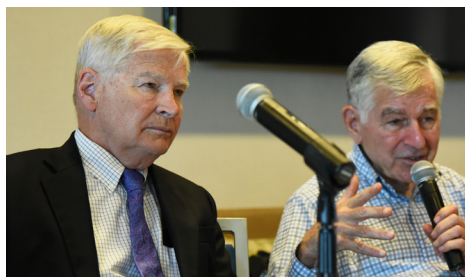
William Bulger and Michael Dukakis visited with political science classes in October.

Former Red Sox slugger David Ortiz spoke about the importance of education at UMass Boston's annual Freshman Investiture Ceremony, congratulating the Class of 2021 on beginning their college careers and encouraging them to continue working hard. Ortiz, a 10-time All-Star who was instrumental in helping the Red Sox win three World Series titles, spent over an hour answering students' questions about his baseball career, his path to success, and his foundation, the David Ortiz Children's Fund. He also posed for students' selfies, and signed dozens of autographs.